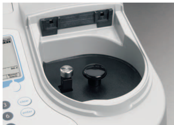
BioMate 3 spectrophotometer with the nanoCell accessory