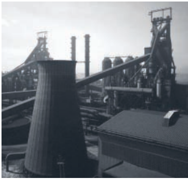
Blast furnaces and cooling towers at the Usinor steel plant

are replaced by serial data communication via RS232, RS422, RS485, or ethernet. Communication protocols include Modbus, Profibus and Alan Bradley Data Highway.