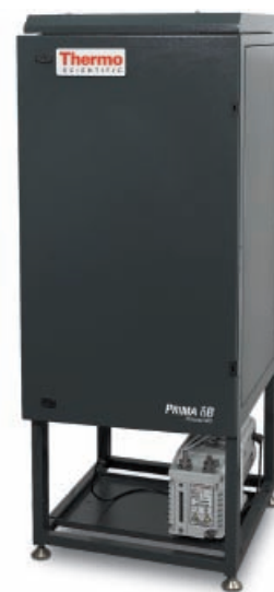
The Thermo Scientific Prima \delta B Scanning Magnetic Sector Process Mass Spectrometer II

It has long been established that the efficient control of the blast furnace process relies on accurate and fast analysis of CO and CO 2 concentration in the top gas.