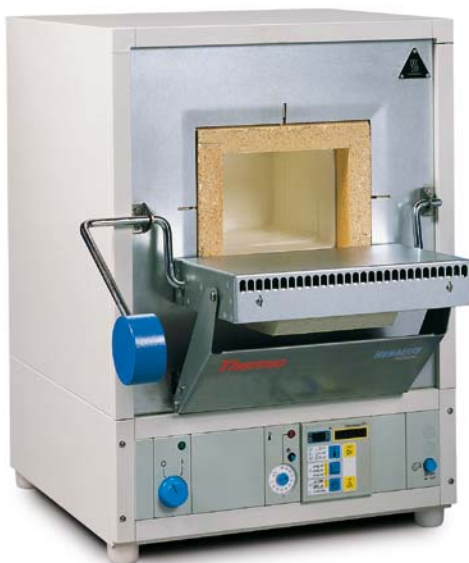
Thermo Scientific Heraeus M 104 Muffle Furnace Chamber volume: 3.5 l