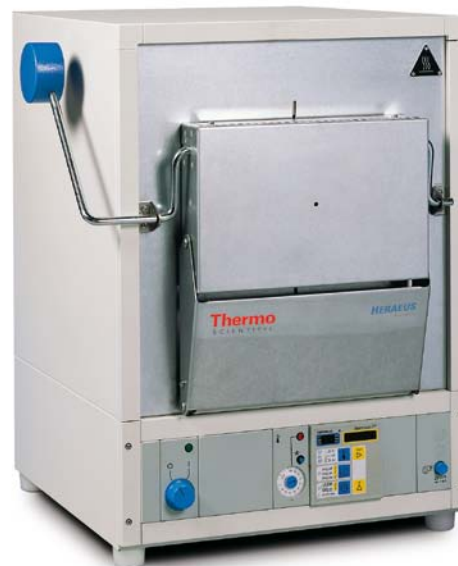
Thermo Scientific Heraeus K 114 Chamber Furnace Chamber volume: 3.5 l