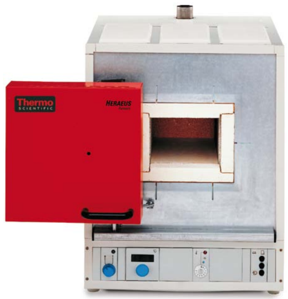
Thermo Scientific Heraeus M 110 Muffle Furnace Chamber volume: 9 l