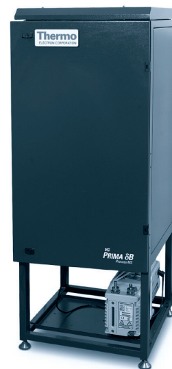
VG Prima \delta B Scanning Magnetic Sector Process Mass Spectrometer

It has long been established that the efficient control of the Blast Furnace process relies on accurate