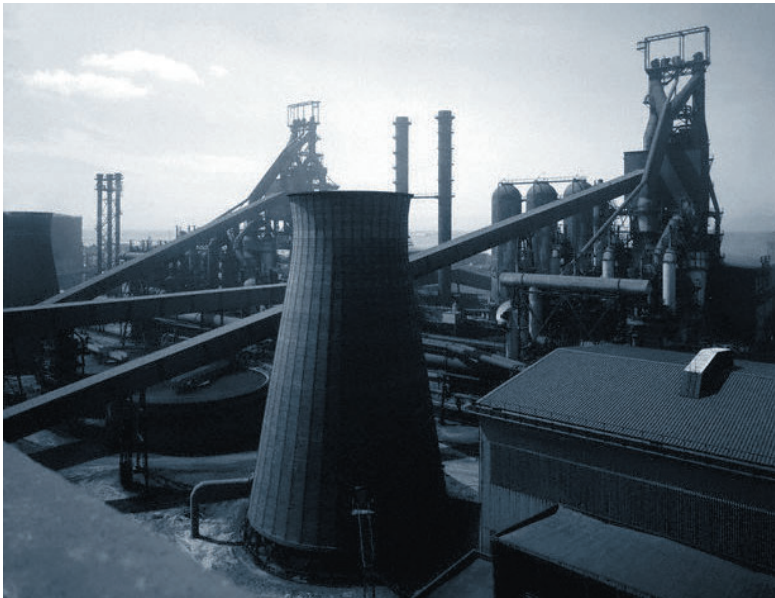
Blast furnaces and cooling towers at the Usinor steel plant

plant's distributed control system (DCS) is by analog and digital hard-wired input/output (I/O) communications. This method of communication is still very popular and is available on all VG units today. In a modern facility, analog signals are replaced by serial data communication via, RS232, RS422, RS485, or Ethernet. Communication protocols include Modbus, Profibus and Alan Bradley Data Highway.