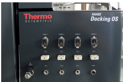
Docking Panel Connections

Torque adaptation to the PolyLab OS rheometer is accomplished via a special coupling specific to the mixer model (see table). The temperature controllers for up to four heating zones plus air cooling are already integrated into the docking station.