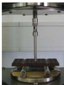
Fig. 1: Test equipment to measure the breaking behaviour of a chocolate bar

222-1276 Adapter coupling with bore 6 mm