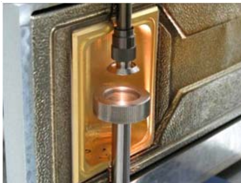
Fig. 2: Detailed view of the new UV curing cell