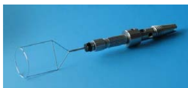
Fig.1: Du Noüy ring with adapter

Lower temperature control unit or universal container holder (603-0304) for an adaptation of the lower setup