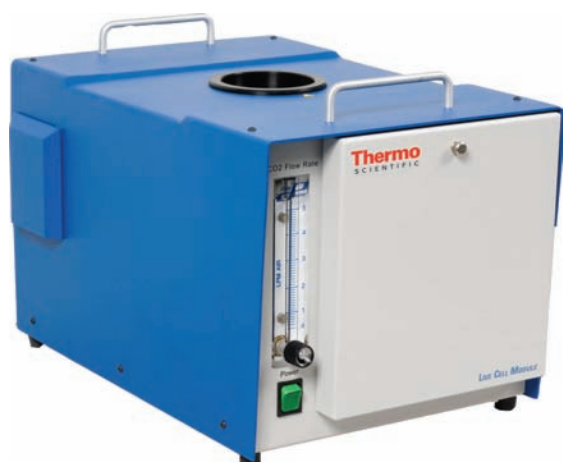
External control unit for Live Cell Chamber